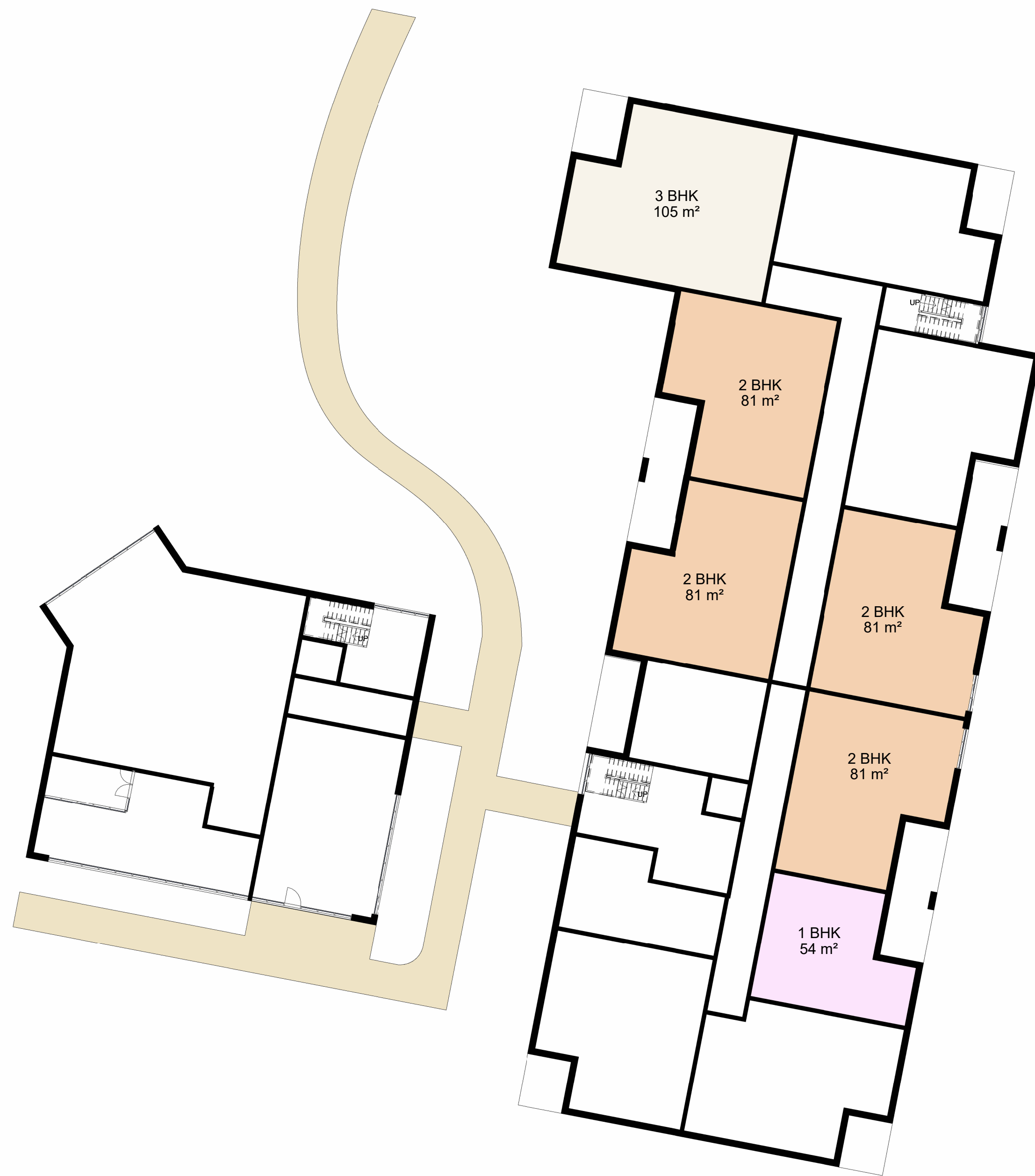
1 Ground Floor 1 : 200

TOTAL = 6 NO. UNITS, 1 X 1 BHK, 4 X 2BHK, 1 X 3BHK